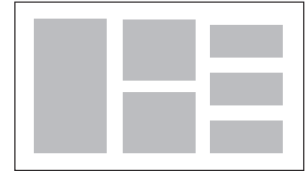
1/3 vertical & 1/6 vertical & 1/12 horizontal